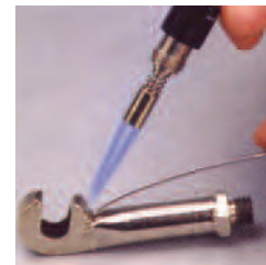
Torch (UT-200 only)